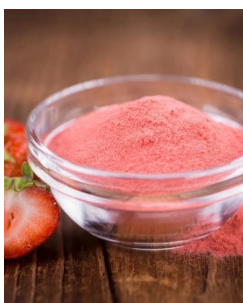
Activated Dry Fruits