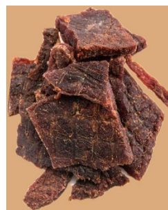
Dried Meat Product