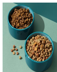
Dried Pet Food