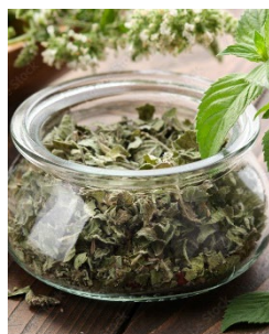
Dried Medicinal Leaves