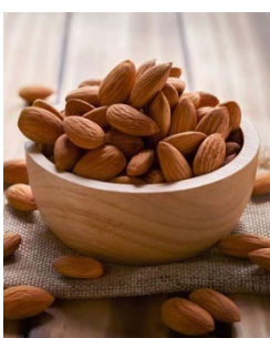
Activated Dry Fruits