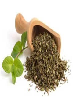
Dried Exotic Vegetables