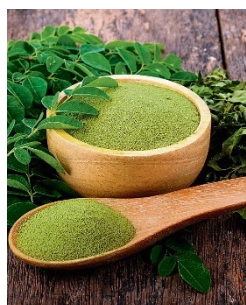
Dried Vegetables Powder