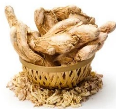
Dried Exotic Vegetables