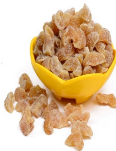
Dried Fruits Candies